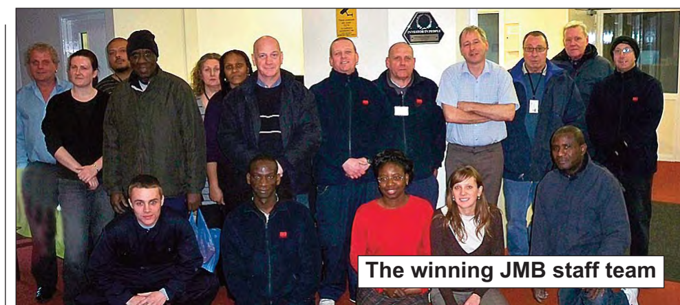
The winning JMB staff team

The JMB is committed to supporting its staff to provide the best service for you – so we are delighted to have won the prestigious 'Investors in People' award.